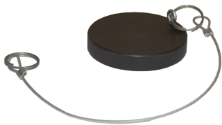
Dust Cap for Adapters

NOTE: For flange dimensions, diagrams, and additional information, please reference dixonvalve.com .