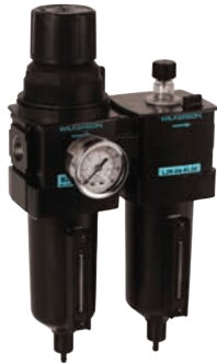
with metal bowl