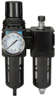
with transparent bowl and guard