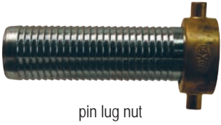
pin lug nut